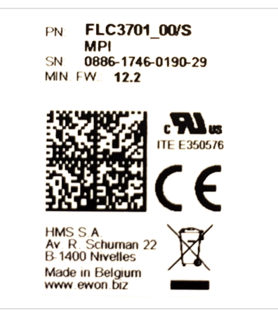
Fig. 2 FLC 3701 Label