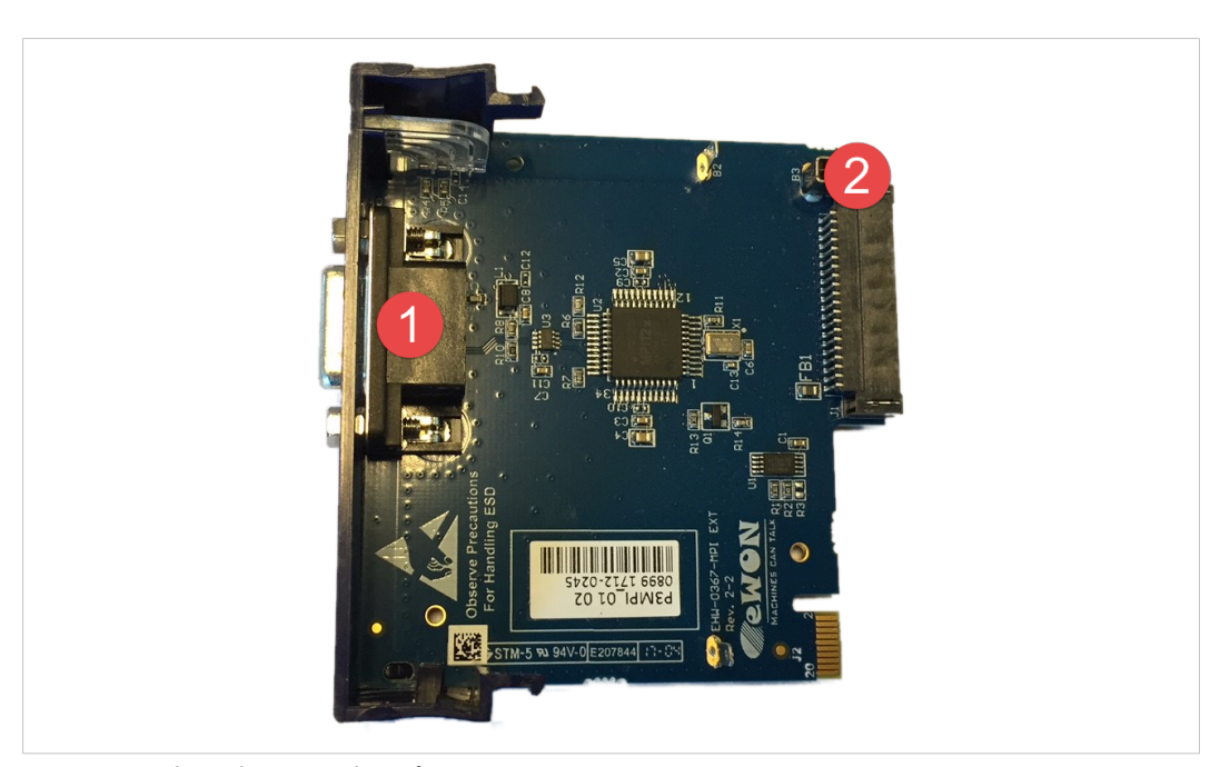
Fig. 1 Mechanical Layout and Interfaces