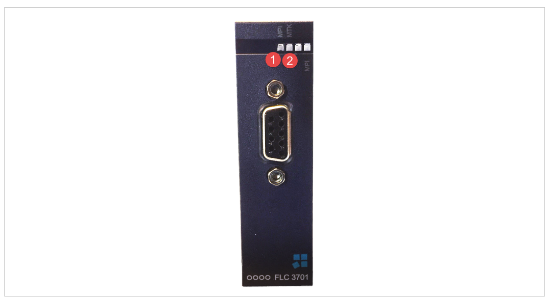
Fig. 3 Front Panel Leds