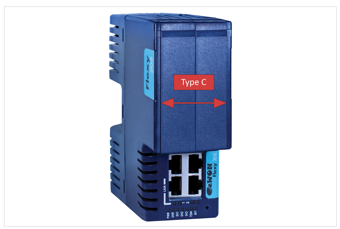
Fig. 4 Position of the "Type C" Slots on a Flexy 205.

The FLC 3701 which is of "Type C" is designed to be inserted in the Flexy 205. It can be inserted in both slots.