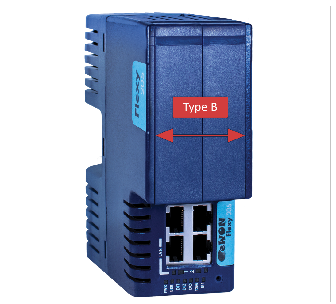
Fig. 4 Position of the "B" Slots on a Flexy 205.

As the Flexy 205 has room for 2 slots, the type slot compatibility rule doesn't apply. The FLB 3271 can be inserted in both slots.