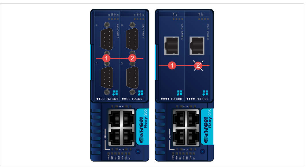
Fig. 7 Order of the Extension Cards

The ignored card(s) will appear in the Diagnostic > Status > System Info > System but they will not be functional.