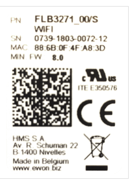
Fig. 2 FLB 3271 label