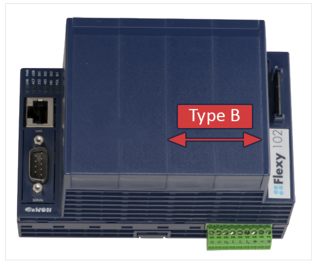
Fig. 5 Position of the "B" Slots on a Flexy 10x & 20x.

The FLB 3271 must be inserted in the "B" slots which are the two slots on the far right of the Flexy 10x & 20x.