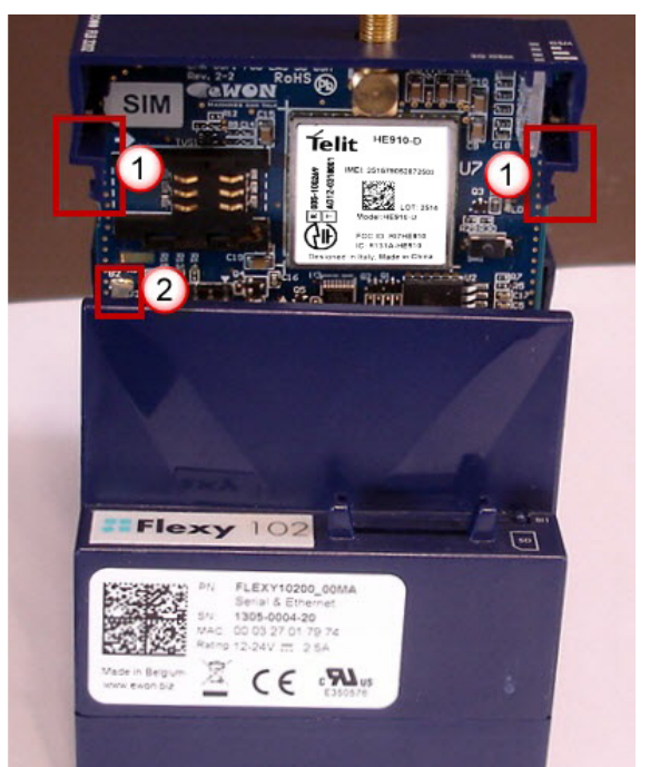
Fig. 6 Remove the slot fillers