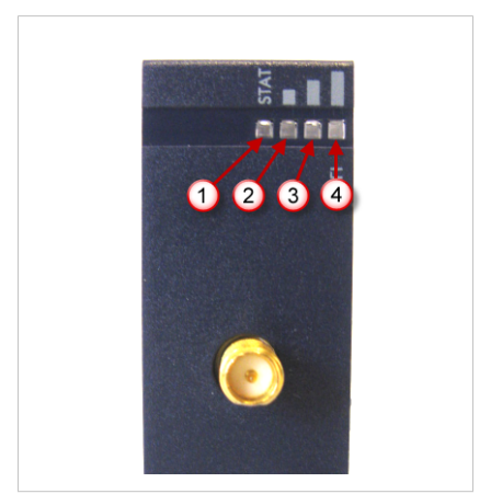
Fig. 3 Front panel LEDs